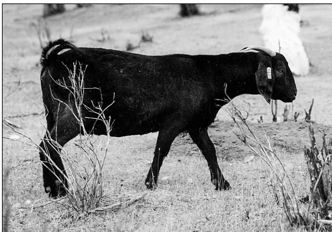
Soils in Western Canada are deficient in iodine, so forage and grain grown here are deficient in iodine.