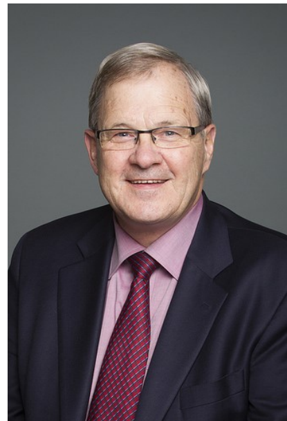
Lawrence MacAulay, PC, MP

A handwritten signature in blue ink that reads "Lawrence MacAulay".